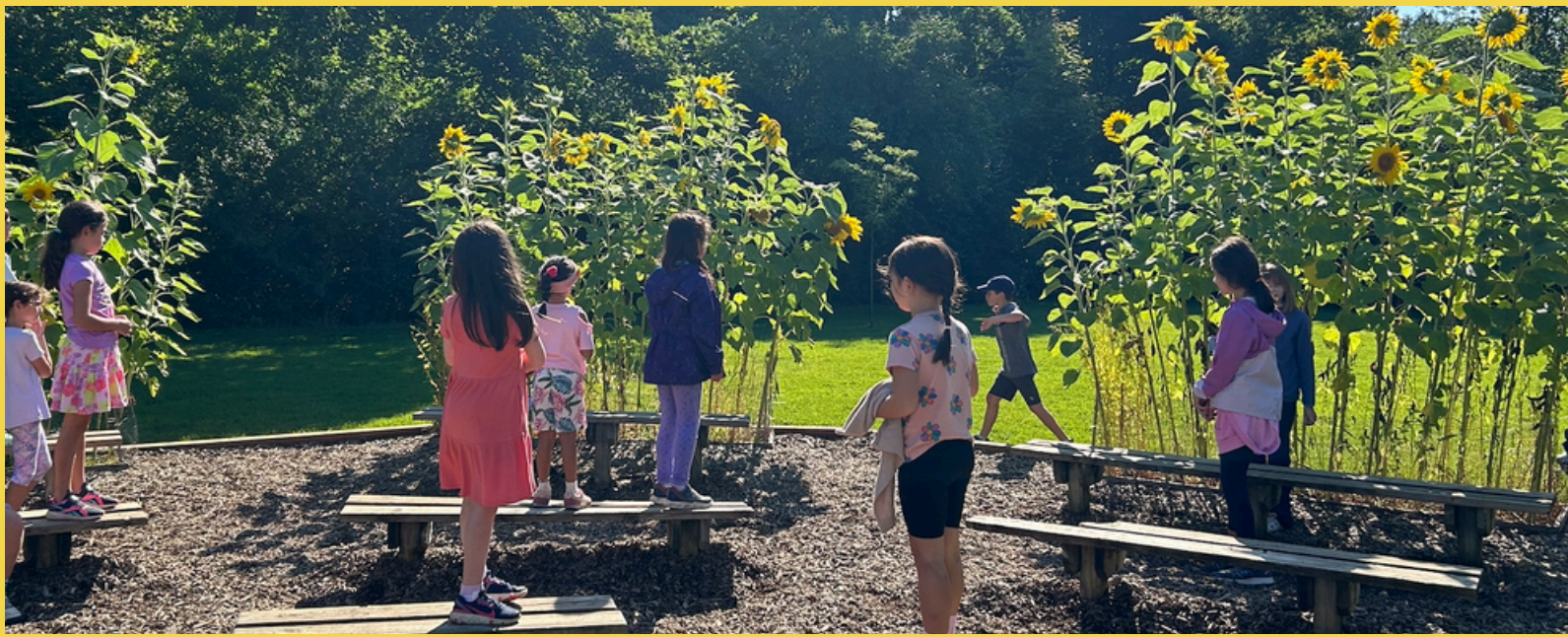
Enjoying our outdoor classroom amidst our lovely sunflowers!